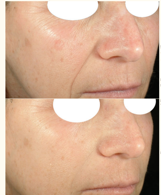
Patient treated with Photo Genesis, Laser Genesis and Titan